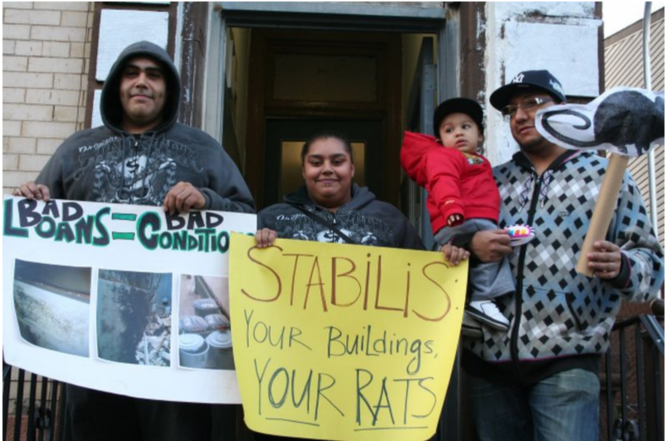
Residents of 755 Jackson Ave. want Stabilis Capital, the owner of their rat-infested, violation-riddled South Bronx building, removed in favor of a city-approved administrator.

Outraged South Bronx residents gathered Tuesday to demand relief from the deplorable squalor they've been enduring since a private equity firm took over their building.