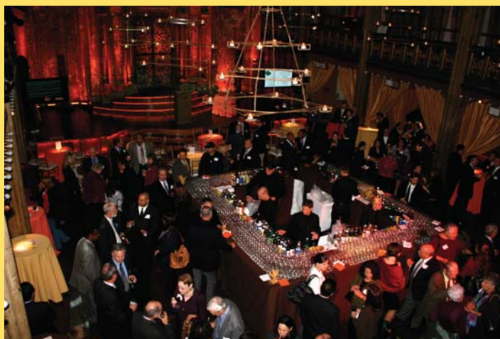
UHAB Celebrated its 35th Anniversary on November 22 at the Angel Orensanz Center