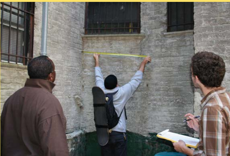
The Weatherization Team participates in the audit of 2178 Atlantic Ave. in Brooklyn. Construction will start in January.