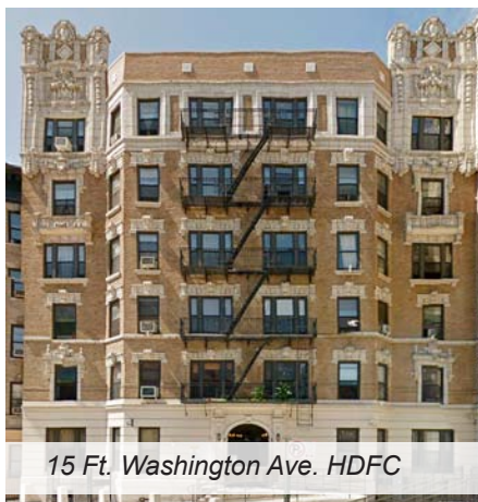
15 Ft. Washington Ave. HDFC

We don't need UHAB as much as we did before, but that's a complete credit to UHAB. It's something to take tremendous pride in. That's the story that needs to be out there: 15 Ft. Washington is standing tall."