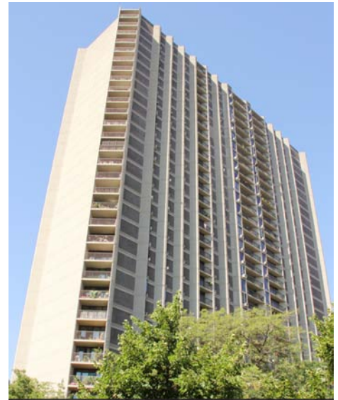
Cadman Towers in Brooklyn Heights

CU4ML and UHAB have been fighting privatization efforts building by building. They worked with shareholders like Syd and Pearlline, and this summer were able to declare another victory.